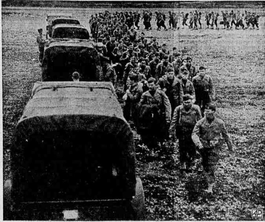
Fort Lewis Troops Start for California—Travelling by trucks and trains, 35,000 soldiers from Fort Lewis, Wash., started a mass movement to California to participate in war maneuvers. First units of the regiments that went by truck are shown about to embark. The movement required 3,500 vehicles and 27 trains.

Baker 46, Benton 45, Clackamas No. 1, 52, Clackamas No. 2, 52, Clatsop 47, Columbia 33, Coos No. 1, 48, Coos No. 2, 30, Crook 19, Curry 18, Deschutes 54, Douglas 37, Gilliam 3, Grant 23, Harney 18, Hood River 32, Jackson No. 1, 30, Jackson No. 2, 49, Jefferson 6, Josephine 31, Klamath No. 1, 64, Klamath No. 2, 87, Lake 21, Lane No. 1, 62, Lane No. 2, 59, Lane No. 3, 58, Lincoln 23, Linn 14, Malheur 62, Marion No. 1, 79, Marion No. 2, 49, Marion No. 3, 46, Morrow 16, Multnomah boards—No. 1, 85, No. 2, 66, No. 3, 79, No. 4, 64, No. 5, 48, No. 6, 81, No. 7, 80, No. 8, 81, No. 9, 49, No. 10, 62, No. 11, 62, No. 12, 34, Polk 52, Sherman 6, Tillamook 32, Umatilla 64, Union 42, Wallowa 17, Wasco 33, Washington No. 1, 45, Washington No. 2, 80, Wheeler 12, Yamhill 62.