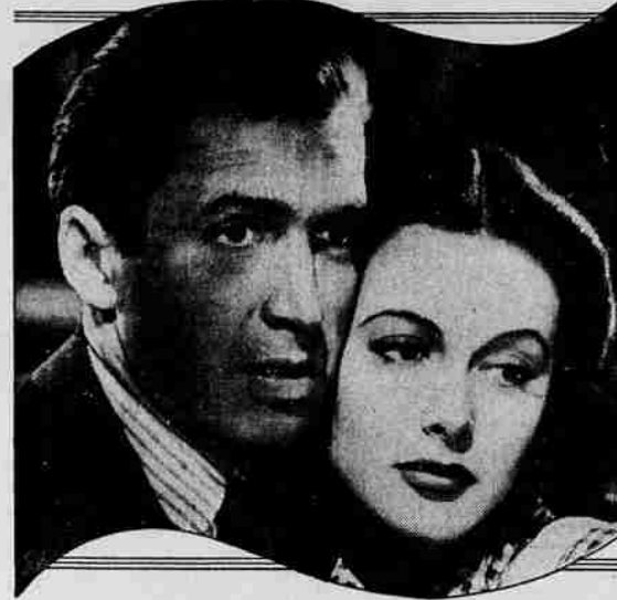
"Come Live With Me" — Co-starring Hedy Lamarr and James Stewart. Playing today thru Saturday with "Come Live With Me" at the State theatre is "The Long Voyage Home" with Thomas Mitchell, John Wayne and Ian Hunter.