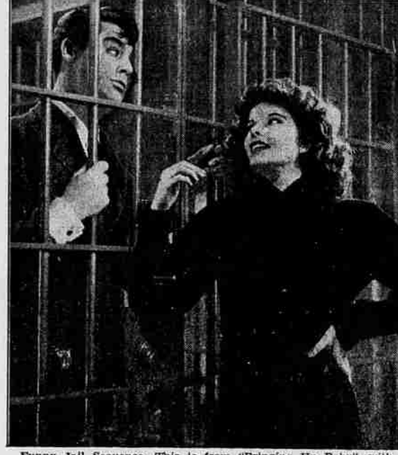
Funny Jail Sequence—This is from "Bringing Up Baby," with Cary Grant behind the bars through no fault but that of Katharine Hepburn's, in a fast comedy romance opening today at the Capitol theatre with "The Great Swindle," with Jack Holt, the companion feature.