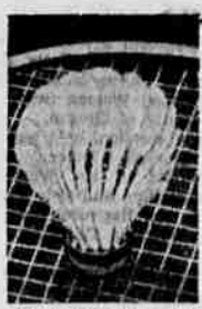
"Birds," 35-50 cents, last about 4 games.

It's A Game Badminton: Watch The Birdie! AP Feature Service BADMINTON, centuries old, did not gain top popularity in U. S. until few years ago, now is top-notch as exercise sport. Small playing space required makes it okay for small gym or backyard. It's a game of terrific volleying with deceptive feathered cork which first travels on line but plummets as it loses momentum. Here's a close-up glimpse.