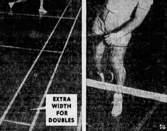
Overhead smash shows wrist flick necessary in all badminton shots.