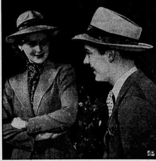
A MATCH FOR SPRING —Since fashion has willed that women copy men's attire, or vice versa, two New Yorkers model the "look-alike" mode. They wear twin wool gabardine suits in a diamond brown shade, plus straws banded in gay prints.