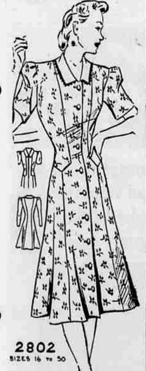
Style No. 2802 is designed for sizes 16, 36, 38, 40, 42, 44, 46, 48 and 50. Size 36 requires 4 1/4 yards of 35-inch fabric with 3/4 yard of contrasting.

Neighbors of Woodcraft will meet at the Fraternal temple Friday night at 8 o'clock. Initiation and drill practice will be held.