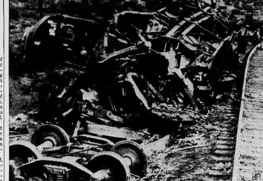
Train Derailment Injured Two—The engine and eight cars of a 16-car combination passenger and freight train overturned near Palmdale, Calif., injuring the engineer and fireman. Twelve passengers in the last car were uninjured. In foreground is one wrecked car, and in left background in the locomotive lying on its side.

Portland, Ore., Dec. 21 (AP)—The Crossett Western company was awarded $100 by a federal court jury yesterday for Bonneville power line right of ways across its property south of Wauna.