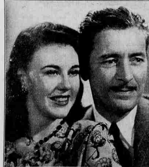
Sparkling Comedy Romance—Ronald Colman and Ginger Rogers are co-starring in "Lucky Partners," which chronicles hilariously the madcap adventures of a pair of sweepstakes winners who use their small prize fortune for a make-believe honeymoon at Niagara Falls, which starts Sunday at the Elsinore theatre in addition to "Young America Flies."