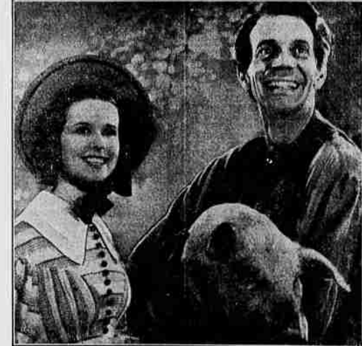
Gay Start of Fated Romance—This shows Mary Howard as Ann Rutledge and Raymond Massey as Abraham Lincoln in the picture version of the Robert E. Sherwood Pulitzer prize drama, "Abe Lincoln in Illinois," starting Sunday at the Hollywood theatre, plus Chester Morris and Anita Louise in "Wagon Westward."