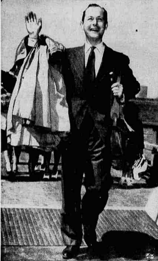
Actor Comes Back From The Wars —Actor Robert Montgomery, erstwhile ambulance driver on the western front, is shown above as he arrived in New York from Lisbon on the Trans-Atlantic Clipper.