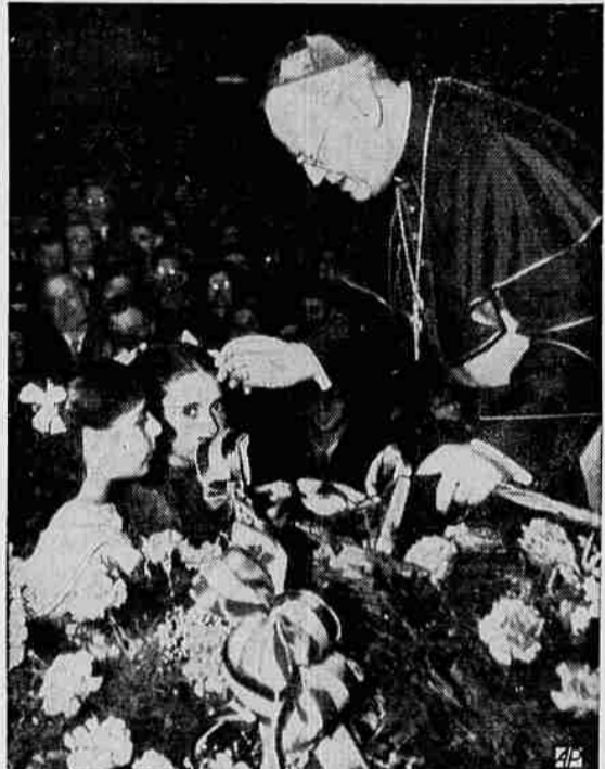
Interdict Lifted; Parishioners Blessed —Two youthful members of the Holy Redeemer Catholic church, Cleveland, Ohio, are shown receiving the blessing of Archbishop Joseph Schrembs following his removal of an interdict from the parish. The church, to be reopened soon, was closed when parishioners refused to accept a priest named by the archbishop. Parishioners have repented their action.