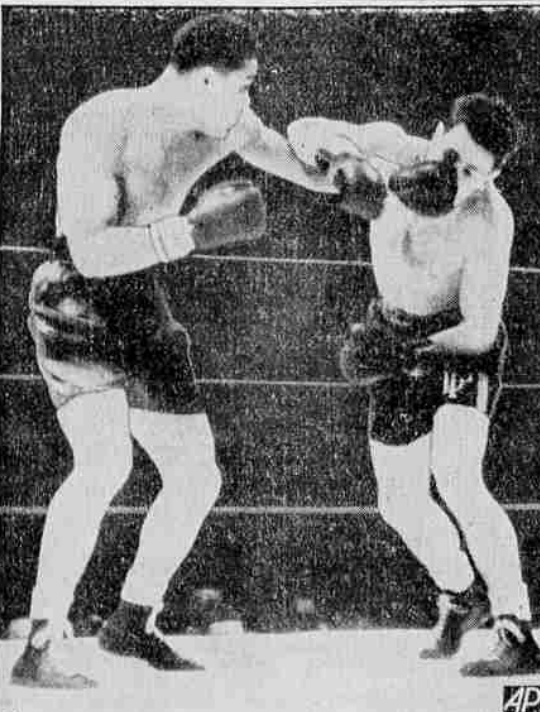
Louis Lands A Left—Heavyweight Champion Joe Louis crashes a left into the face of Challenger Bob Pastor, ex-New York collegian, in the first round of their bout at Briggs Stadium, Detroit. Louis knocked out Pastor in 38 seconds of the eleventh round to retain his World's Heavyweight championship.