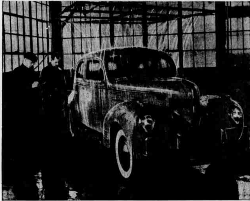
The close attention with which the manufacturers of Dodge automobiles guard their product's reputation is illustrated by their employment of a "Rain-Maker." This "Rain-Maker" exposes the entire car to an artificial downpour. The drenching searches every seam of the body structure for chances to penetrate to the interior of the car. While the man-made rain tests doors, windows, cowl, side ventilators, hood and luggage compartment—checkers go over every part of the car, inside and out, making sure that it is water-tight so that the car's owner and his passenger travel in comfort, and remain dry, in all kinds of weather.