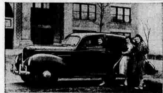
When Keuka College, in the Finger Lakes region of Central New York, found it necessary to curtail bus service to Penn Yan, the nearest village, the decision, coupled with the faculty's ruling against hitch-hiking, created a serious transportation problem. Then a financial wizard arose from the student body. Result: The girls, with the co-operation of the college, engineered the purchase of a new 7-passenger Dodge sedan. Each girl buys a minimum of fifty ride tickets annually. The proceeds pay for operation and maintenance, also the installment on the purchase deal. The Dodge makes six scheduled shuttle trips daily.