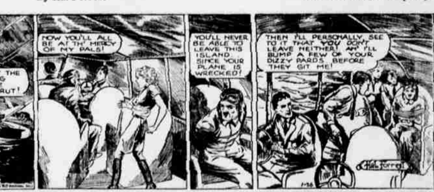
The King of Boloney is Just Plain Boloney Over Here