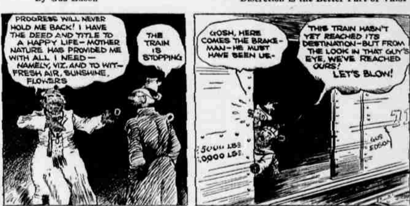
The Whole Boloney