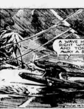
The Whole Boloney