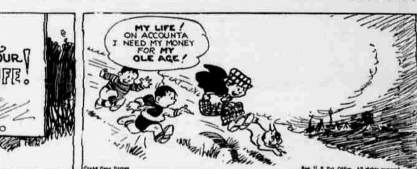
Skeeter Makes a Prophecy?