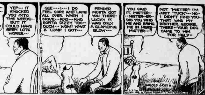
Discretion is the Better Part of Valor