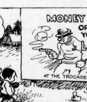
Discretion is the Better Part of Valor