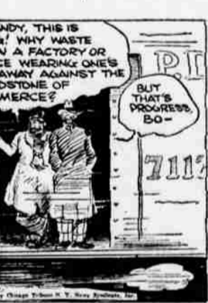
Skeeter Makes a Prophecy?