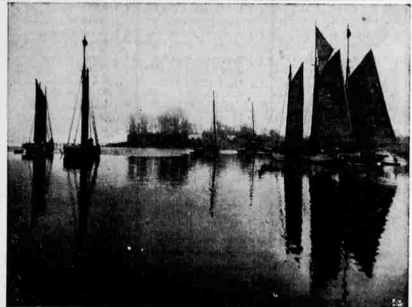
FOUR BELLS AND ALL'S NOT WELL among some Chesapeake oyster fishermen. State conservation officials trying to curb illegal dredging tied up many boats at Annapolis, Md.