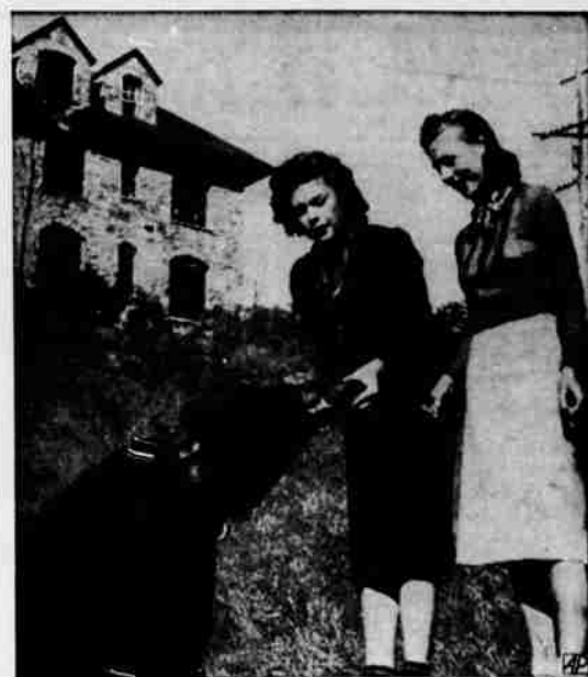
THE CO-EDS' PRIDE at Lees-McRae college at Banner Elk, N. C., is "Grizzly," a bear who's the campus man-hater.

There will be a B.P.W. board meeting prior to the regular Business and Professional Women's banquet at the Golden Pheasant Tuesday night at 6:30 o'clock.