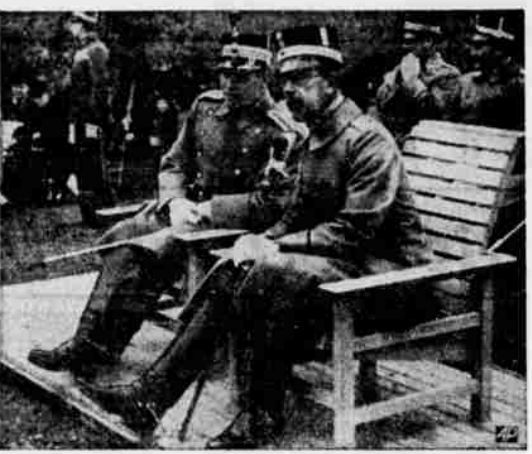
PEACE ON EARTH —The northerly earth that represents Norway and Sweden was symbolized at Fredriksten in Norway, when Crown Prince Olaf of Norway (left) and Crown Prince Gustaf Adolf of Sweden attended the unveiling of a Norwegian monument to the Swedish king, Charles XII. The monument is intended to demonstrate the two nations' mutual will to keep the peace.