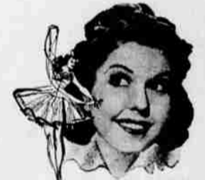
ANN MILLER utterly charming as Essie Carmichael... who dances for joy!