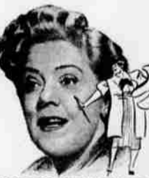
SPRING BYINGTON delicious as Penny Sycamore... who'd love to be a writer!