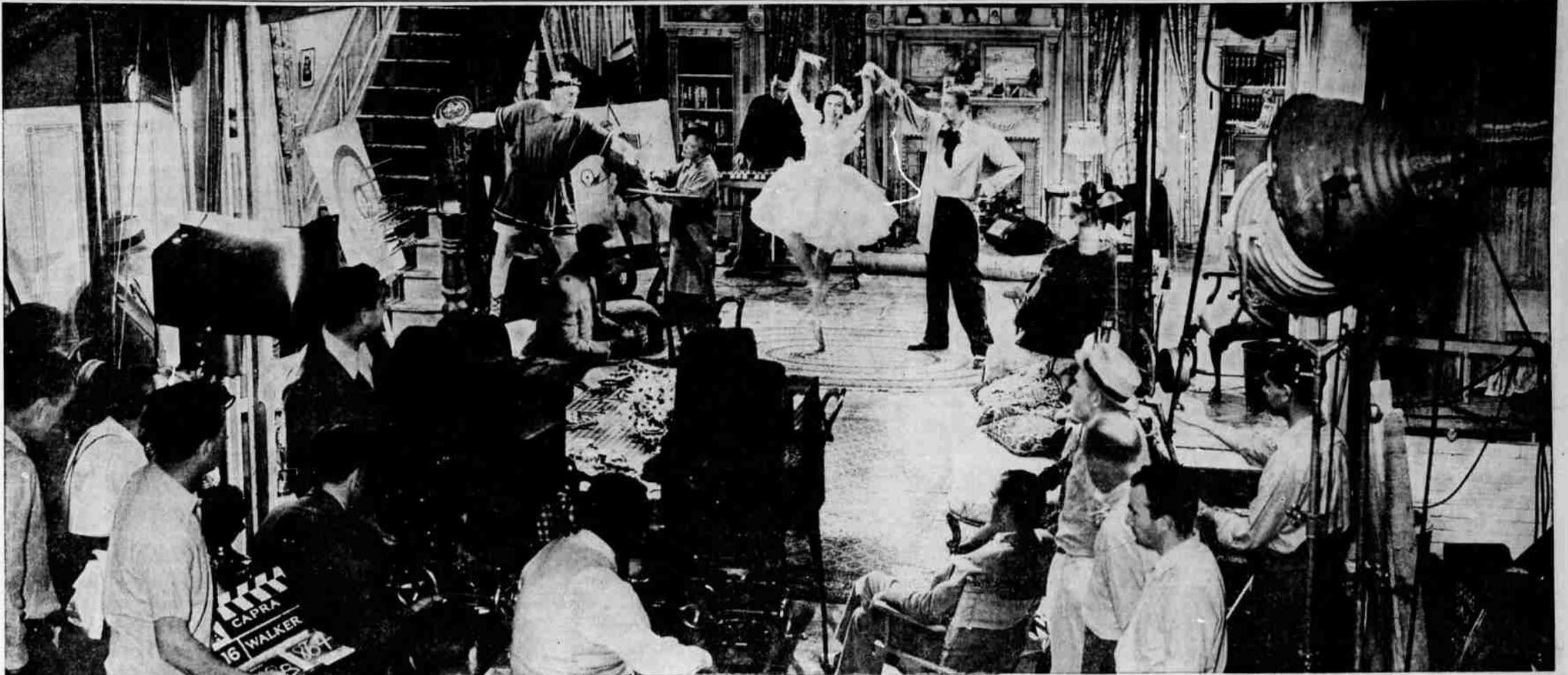
Behind The Scenes During the Making of the Best of Comedies—Here's what the camera behind the cameras and microphones caught during the filming of "You Can't Take It With You," which should top the 'Best 10' and which comes to the Grand screen Friday.