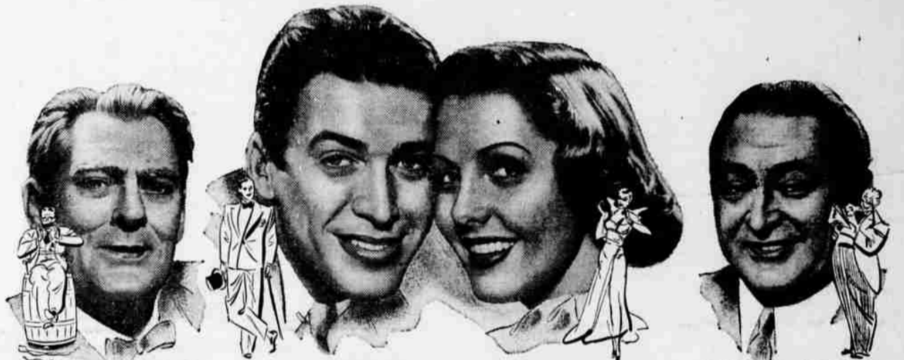
LIONEL BARRYMORE in his most lovable role as Grandpa Vanderhof, who quit work—for fun!