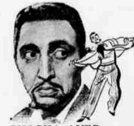
MISCHA AUER furious as Boris Kolenkhov, Russian dancing teacher...!