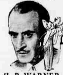
H. B. WARNER powerful as Ramsey, paying the price of fighting Wealth!