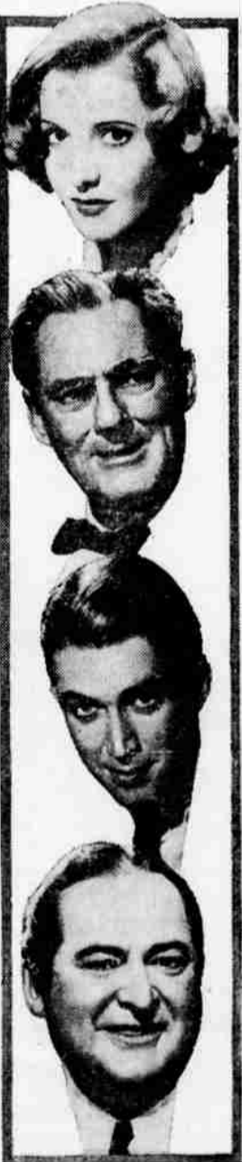
Principals in Frank Capra's "You Can't Take It With You," which opens today at the Grand Theatre, are Jean Arthur, Lionel Barrymore, James Stewart and Edward Arnold. George S. Kaufman and Moss Hart wrote the original Pulitzer Prize play, which Robert Riskin adapted to the screen for Columbia.

Frank Capra's production of "You Can't Take It With You" is showing locally at the Grand theatre. Supporting Arthur, Barrymore, Stewart and Arnold is a strong cast of favorites including Mischa Auer, Ann Miller, Spring Byington, Mary Forbes, H. B. Warner, Halliwell Hobbes and Donald Meek.