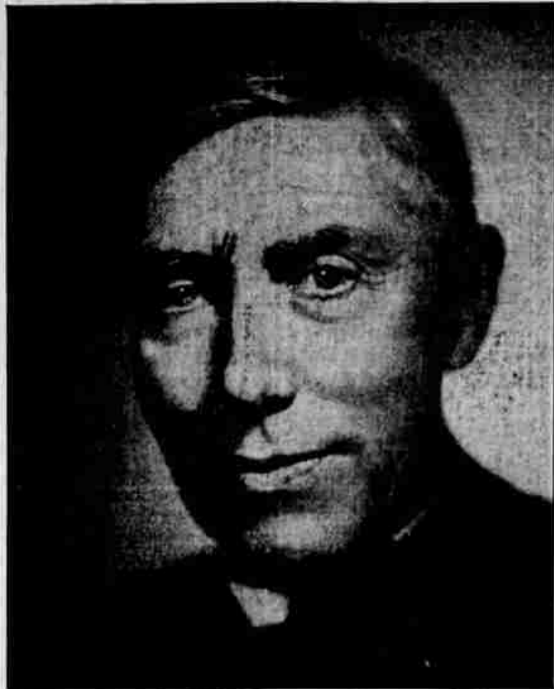
The Rt. Rev. Henry St. George Tucker, D. D.—Bishop of Virginia and Presiding Bishop-Elect.

PRESCRIPTIONS Filled Carefully and Promptly QUISENBERRY'S CENTRAL PHARMACY 410 State St. Ph. 9123