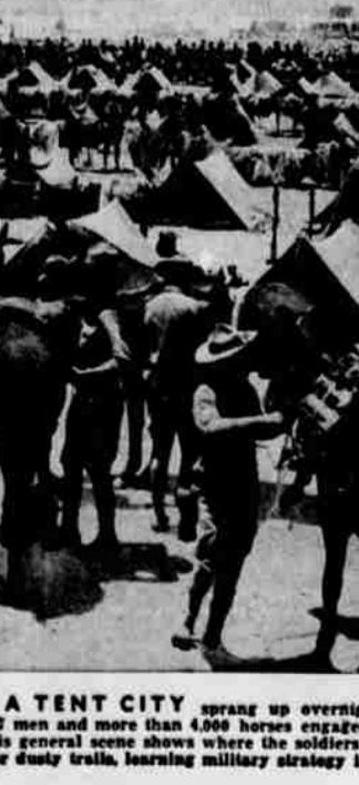
IN TEXAN HILLS A TENT CITY sprang up overnight to shelter men of the First Cavalry division when 3,947 men and more than 4,000 horses engaged in war maneuvers in the Big Bend country. This general scene shows where the soldiers lived when they weren't urging their horses over dusty trails, learning military strategy in the rough country.