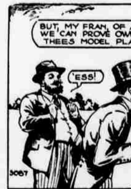
By Bud Fisher