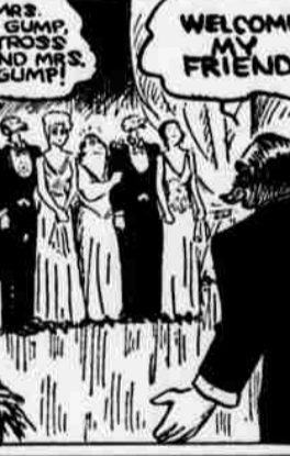
By Hal Forrest