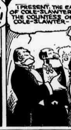
By Hal Forrest