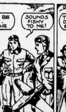
By Bud Fisher