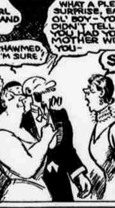
By Hal Forrest