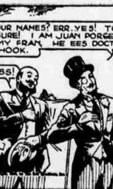
By Bud Fisher