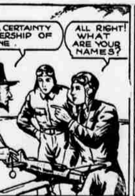
By Bud Fisher