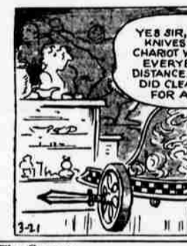
By Gus Edson