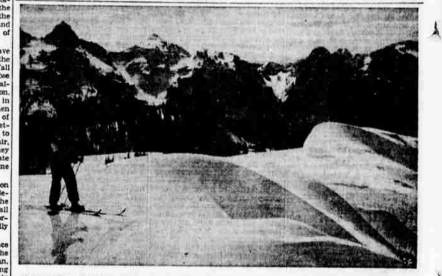
THERE'S SNOW TO SPARE high above Paradise valley in Mount Rainier national park. Washington, where a lone skier makes her way with only a shadow for company. The Pacific coast conference ski tournament will be held here the last of February.