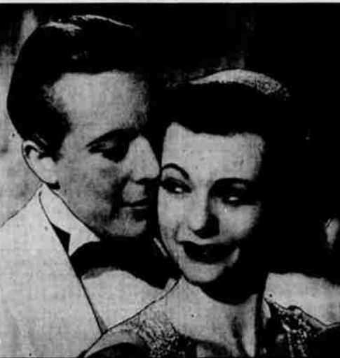
This is Some Party—Screen star Gene Raymond makes love to radio sensation Harriet Hilliard in "Life of the Party" which starts today at the Elmore.