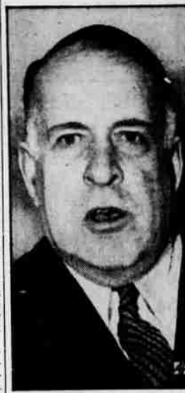
AN ANSWER is in order, says Sen. David I. Walsh (D-Mass.) (above), from Justice Black on his KKK affiliations.