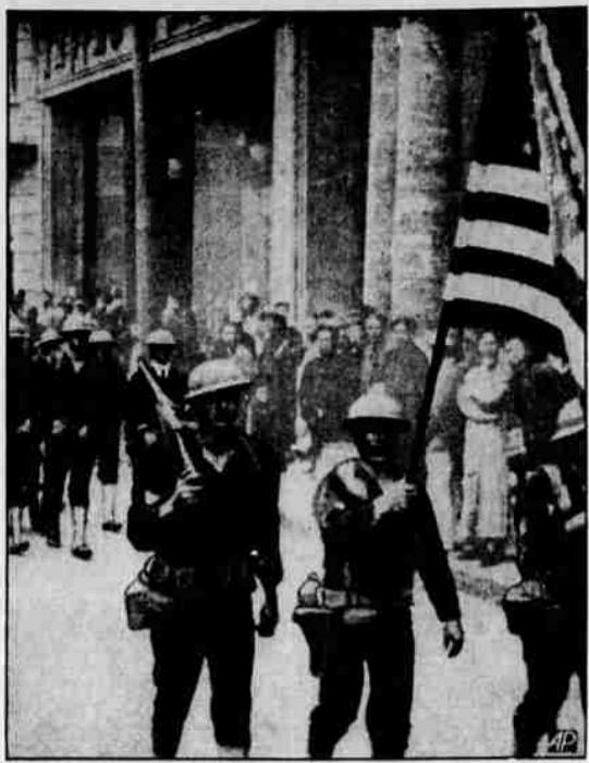
THUNDER OVER SHANGHAI. Troops, guns and marching men of many nations rattled in increasing tempo down Shanghai's streets as that international city of the Far East with 3,000,000 residents . . . 3,000 Americans among them . . . seemed caught in the deadly Sino-Japanese conflict. Japan's mighty warships filled the harbor and Nipponese bluecoats unloaded tons of munitions. These American troops at Shanghai were prepared for "any eventuality."

Hand grenades started bursting. Men were screaming. Bayonets were used as daggers. The struggle lasted for an hour, then the Asturians fell back into the fog.