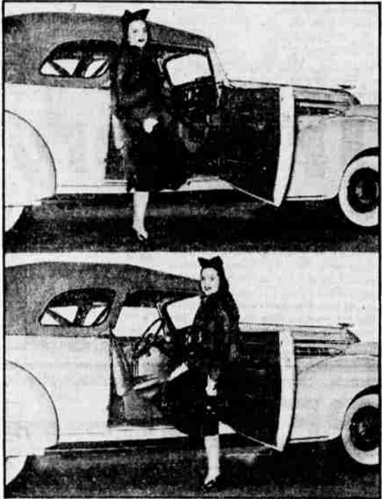
Above, incorrect way of entering car—placing left foot on right running board. Below, correct way of entering car—placing right foot on right running board.