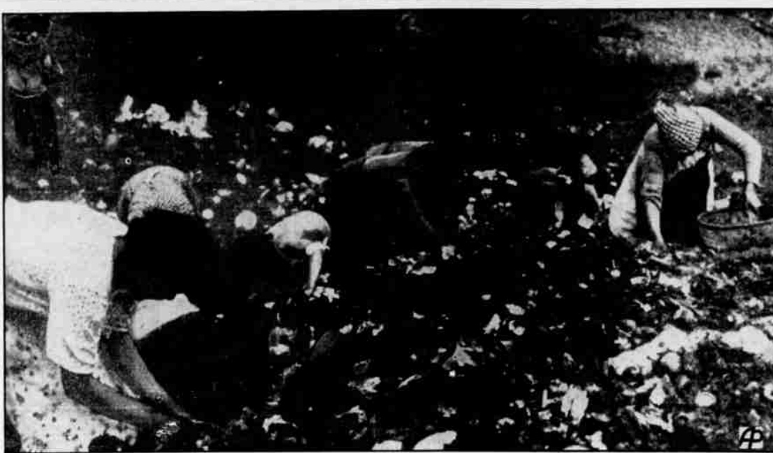
CAFETERIA LA BASQUE. In the garbage dump at Bilbao, Spain, these housewives are shown foraging for food. Bombs and cannon destroyed their supplies, closed highways and wrecked railroads. Thousands were forced to take their food where they could find it. These war-time gleaners explained that orange and potato peelings were considered the choice morsels to be obtained in this fashion.

Payments under the Oregon law become effective next January 2.