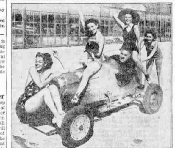
Stars and near stars of the screen take time off to show their idea of Summerizing, as practiced on the beach. They picked a midday racing car, and, after having some Summerized or properly inspected, started out for a real spin. And, did they get a thrill, with Henry Armetta, popular Italian comedian, at the wheel! Pictured from left to right they are: Judith Barrett, Ann Preston, Henry Armetta, Doris Nolan and Diana Gibson, the girl on the roller skates.