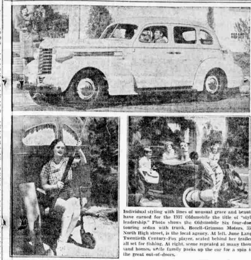
Individual styling with lines of unusual grace and beauty have earned for the 1937 Oldsmobile the title of "style leadership." Photo shows the Oldsmobile six four-door touring sedan with trunk, Bozell-Grimson Motor, 220 North High Street, is the local agency. At left, June Lang, Twentieth Century-Fox player, seated behind her trailer, all set for fishing. At right, scene prepared at many thousands of homes, while family picks up the car for a spin in the great out-of-door.