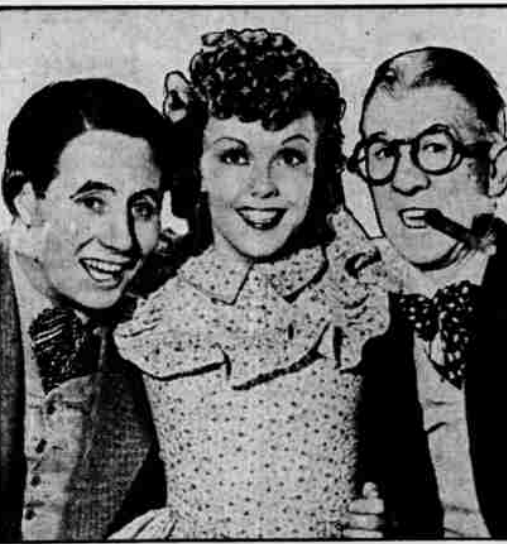
Wheeler and Woolsey and Dorothy Lee in "Silly Billes," at the State theatre today and Wednesday on a double bill with Tim McCoy in "The Outlaw Deputy."