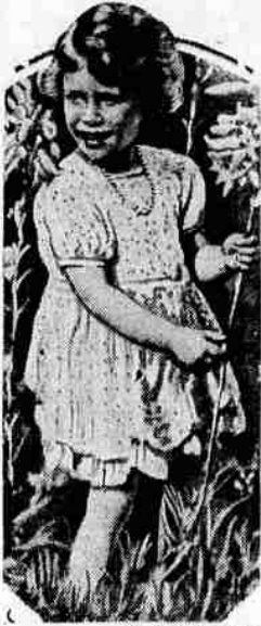
PRINCESS ELIZABETH