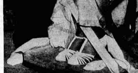
The bells are operated with several wires, also.

When I use a girl as the medium in a demonstration, she is actually bound and tied. But the cabinet that is put over her has a series of black piano wires through it, which are very strong and very taut. When I place a tambourine inside the cabinet, I do it in such a way that it balances on the wires, then with the proper pressure it will bounce up and down, finally springing off.