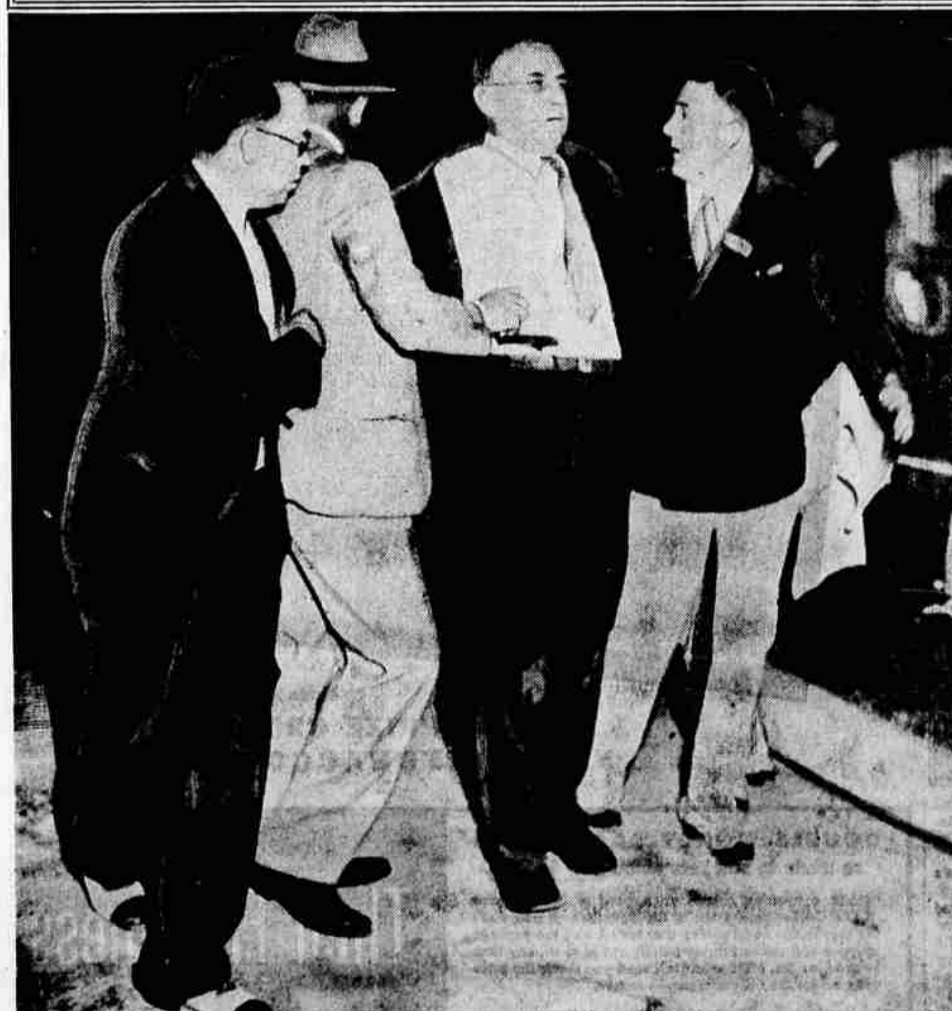
A bullet intended for President-elect Franklin D. Roosevelt, fired by Giuseppe Zangara while Mr. Roosevelt sat in a car at Bay Front Park, Miami, Florida, February 15, 1933, struck and fatally wounded Mayor Anton J. Cermak of Chicago. Mayor Cermak, who died March 6, is seen in this photo just after the shooting as he was being helped to a car. Zangara was electrocuted.

THIS type of bunco artist has it all over the wire-tappers in other respects. A wire-tapper has one definite type of information to sell. The clairvoyant sells whatever his client wants, whether it is love advice, business advice, a message from a dead grandmother or a prediction of success as a movie star.