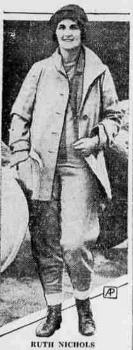
RUTH NICHOLS BADLY INJURED

Troy, N. Y., Oct. 21 (AP)—Miss Ruth Nichols, one of America's ace airwomen, and five of her employes were injured today in the crash of a big 290 passenger plane at Troy airport.