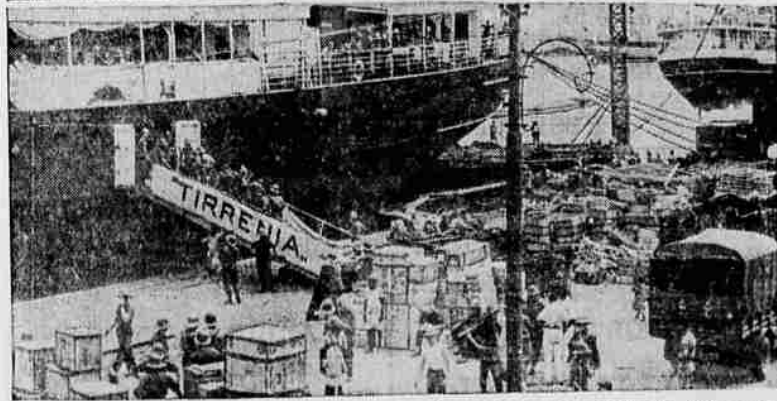
MEN AND SUPPLIES —Italy has sent nearly a million men to the Ethiopian battle scene, along with countless millions of dollars worth of supplies. At top is a group of infantrymen in Eritrea and below, supplies being unloaded at Massawa, Eritrea.