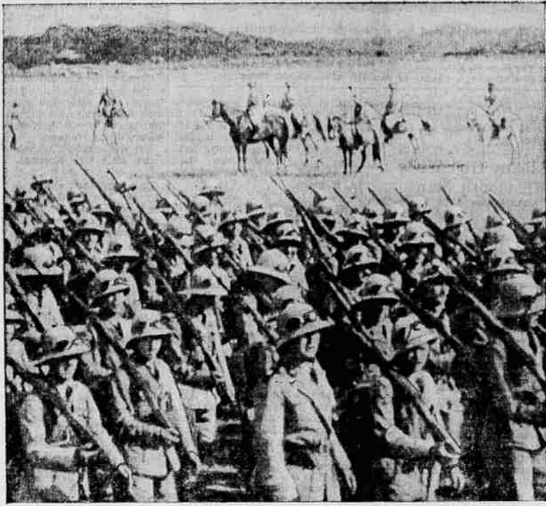
REVIEW BEFORE THE BATTLE —Bayonets fixed, Italian soldiers march in review before their leaders a few days before hostilities began. They are pictured in Eritrea.