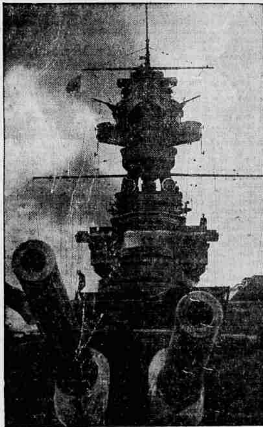
BRITISH WATCH DOGS —As Italy and Ethiopia clashed, a mighty British fleet was poised in the Mediterranean awaiting developments. Here is an example of the huge guns the British are prepared to man if trouble arises involving any British rights or possessions.