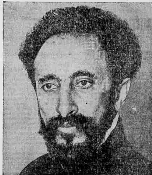
HE LEADS THE ETHIOPAINS —Emperor Haile Selassie of Ethiopia, the King of Kings, who sounded the war call to his people to defend their free country.