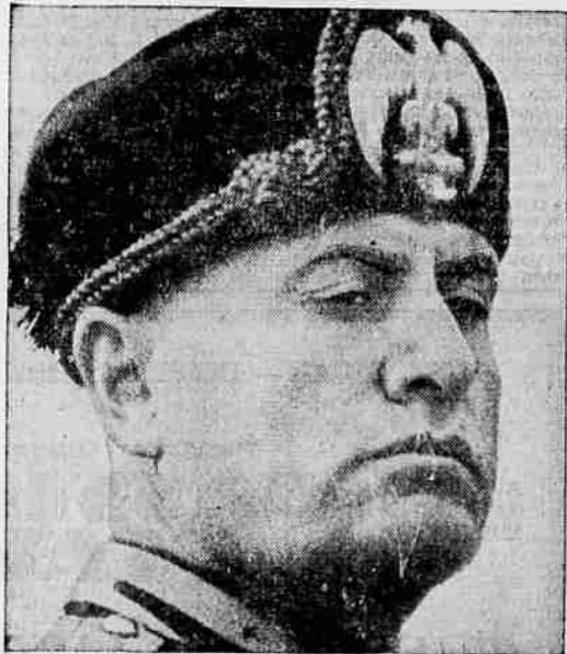
HE LEADS THE ITALIANS —Dictator Mussolini, ruler of all he surveys in Italy, who set as his goal the conquest and colonization of African Ethiopia.