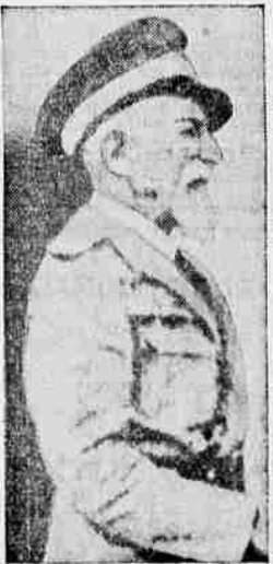
DIRECTS CAMPAIGN —General Emilio De Bono was caught in this military pose as he reviewed Italian troops in Eritrea, near the Ethiopian border. He commands the Italian expeditionary forces.