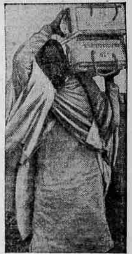
AMMUNITION —For Ethiopia ammunition may be a deciding factor in the war as the supply has been reported small. Native runners carry it on their shoulders and head.