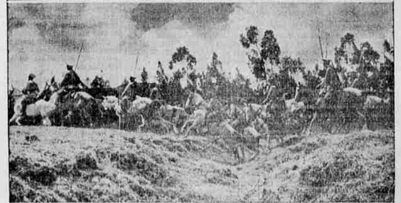
CABINET AND CAVALRYMEN —Above is the Ethiopian cabinet, dressed in braided uniform and cockade hats, while below, is a detachment of fierce Ethiopian cavalrymen as they dashed at full gallop across a ditch.