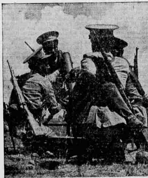
READY —Ready for the invader are these Ethiopian soldiers as they prepare to fire a round from their small field gun.