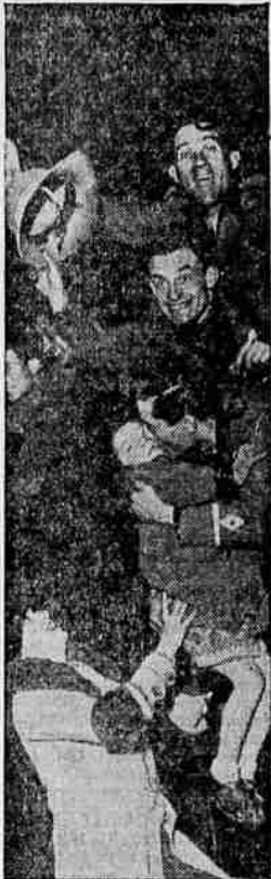
FAREWELL —Italian troops continue to be rushed to the battlefield. Here a fond father bids his small daughter goodbye as he and his fellow soldiers entrain.