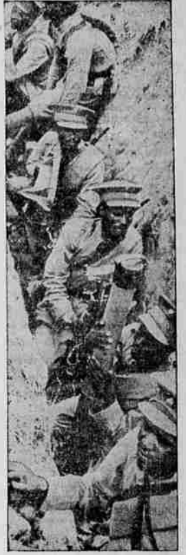
WATCHFUL WAITING —Ethiopian "regulars" entrenched in a frontier sector awaiting the Italian enemy.