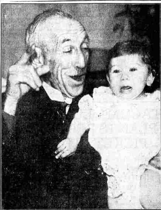
William Hughes, 70, who won world recognition as war-time prime minister of Australia, is playing a new role now as minister of health, leading a campaign to reduce the maternal mortality rate. He is visiting a little friend at a Melbourne maternity home.