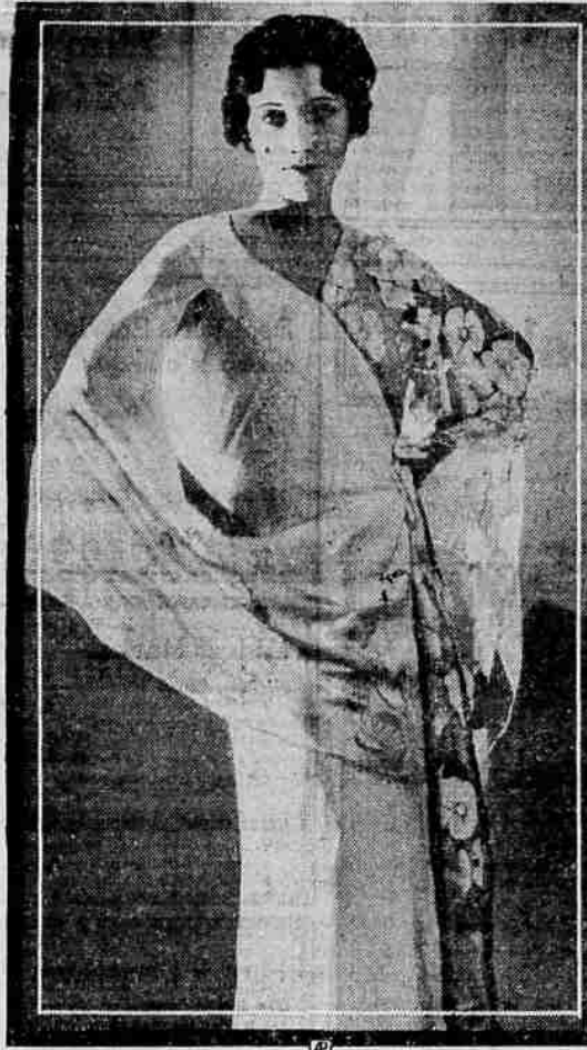
Long slender lines distinguish this negligee of white crepe. The sweeping sleeves and side drapery are of white embroidered mousseline.

Paris (AP)—The new negligees are as elegant as evening gowns, with heavy crepes and dull satins cut on long slender lines prominently featured.