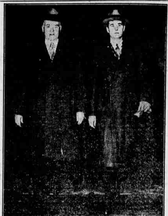
During his stay in New York after leaving the White House, Mr. Hoover made a brisk early morning walk...