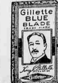
No package contains genuine "BLUE BLADE" unless it carries the portrait of King C. Gillette.

Ask your dealer to show you our special Gift Box containing 100 "BLUE BLADES." You pay for the blades alone. The handsome cigarette or jewel case—rich mahogany color—is free.