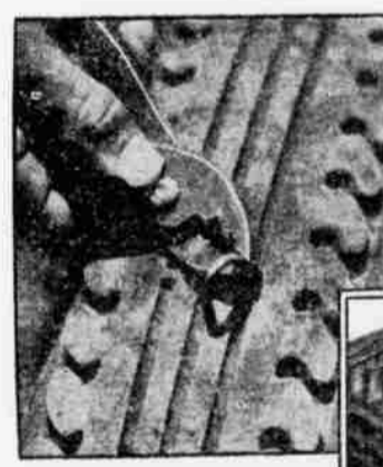
Pull out the nail—the air stays in! Air Containers seal punctures on running wheels.

You'll learn why AIR CONTAINERS end tire troubles