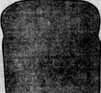
Even brown all over Fitting snugly up against the toaster grid, slices of Snowflake are browned to a delicious crispness all over ... better toast.

RISP and evenly toasted a golden brown - all over is toast made from slices of Hillman's Snowhake Butter-Nut bread, because Snowflake is just the right shape and size for slices to fit up snugly against the toaster. While this feature of Snowflake bread is appreciated by housewives who are quick to utilize new ideas, it has other advantages. It slices easily and uniformly, has a tender crust and the delicious flavor that stamps all Butter-Nut products from this modern, spotless bakery.