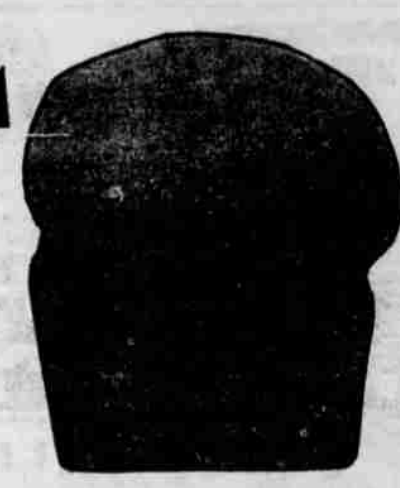
Slightly burned at bottom

With the old-time shorter, chunkier loof slices usually extend above the edge of the toaster, causing the lower half to be