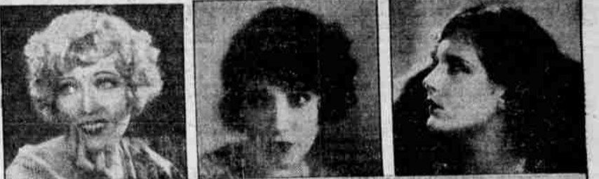
MARION DAVIES Famous screen star BEBE DANIELS Radio Pictures' Player EVELYN BRENT Paramount

If you aren't already using this delightful soap, order several cakes—today. Its caressing lather will keep your skin lovely, just as it keeps the skin of the famous stars.