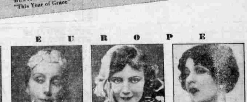
BEATRICE LILLIE "This Year of Grace" LENORE ULRIC "The Sandy Hooker" ANN PENNINGTON George White's "Scandals"