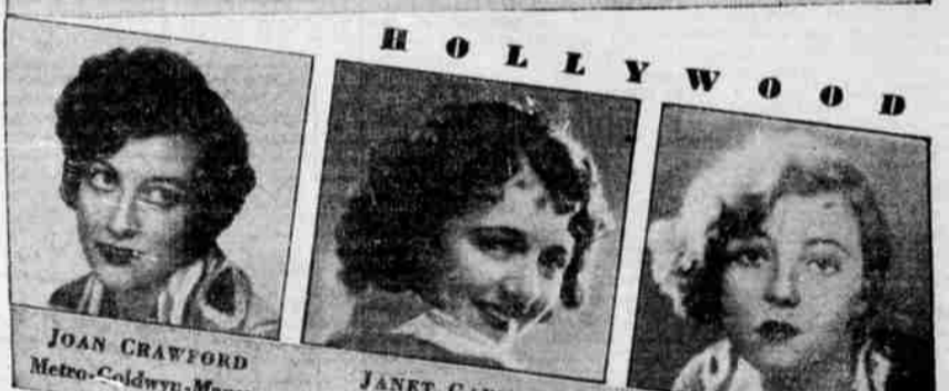
JOAN CRAWFORD Metro-Caldwyn-Mayer JANET GAYNOR Fox Films DOROTHY MACKAIL First National