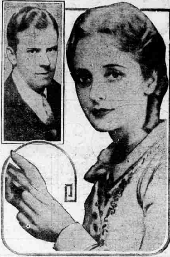
Evelyn Laye, English songstress in "Bitter Sweet," and Jack Whiting, who glorifies the coast guard in "Heads Up!" are listed as the foremost ingenue and juvenile of the current musical shows on the all-Broadway team picked annually by a dance magazine.