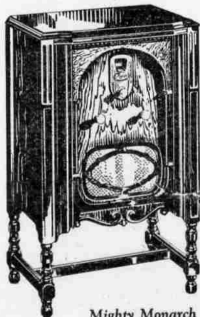
Mighty Monarch of the Air