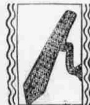
Men's New Ties 59c

Idle shirts, with non-shrinkable collar bands. New Fall patterns and colors. Sizes 14 to 19.