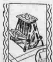
Electric Toasters 69c

Montag's combination note paper and envelopes all in one. Just write the note, seal the flap and it's ready to mail.