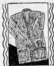
Men's Sport Coats $3.95

AGENTS FOR: ENNA JETTIC—GORDON HOSE—KAYSER—PRINTZ—BUTTERICK — VOGUE — EVERFAST — VAN RAALTE — VANTA