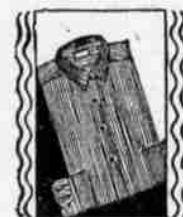
Men's Dress Shirts $1.95

Made of fine yarns knit to snugly beneath your outer garments. Blue, tan, brown heather colors.