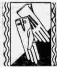
Boys' School Gloves $1.00

A special purchase of regular $1 ties showing newest Autumn patterns in good durable fabrics.