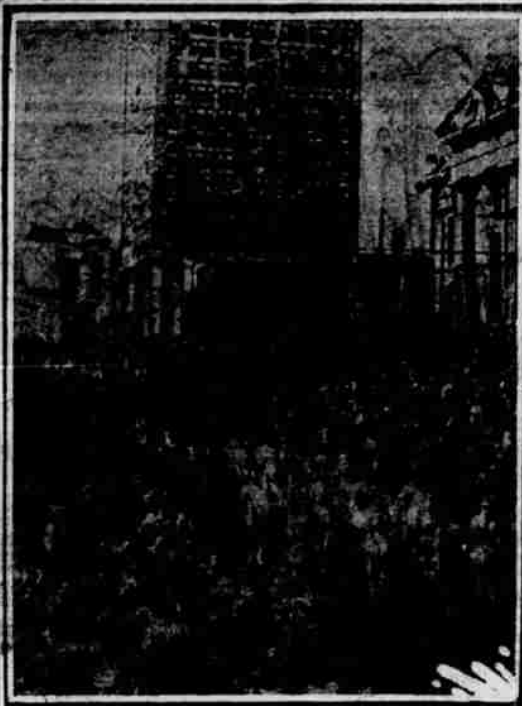
Legionnaires parading past the reviewing stand during the American Legion national convention in Louisville, Ky.