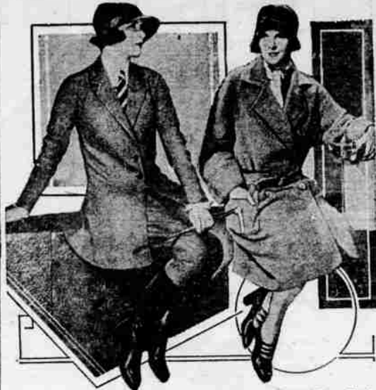
On the left is an attractive new riding habit smart for country riding. The new Brampton coat, an attractive light coat for travel, from Franklin Simon is shown on the right.