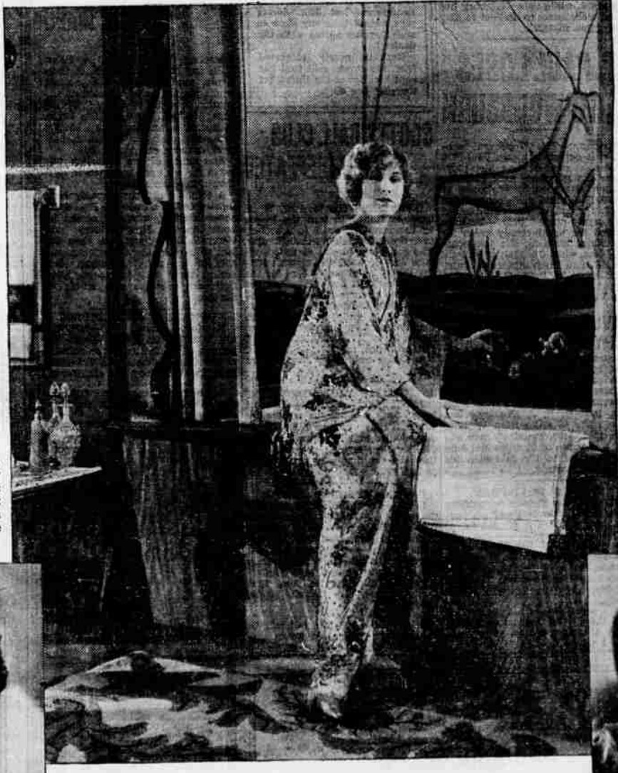
ESTHER RALSTON, famous Paramount star, in the charming and luxurious bathroom which was built in Hollywood for her. She says: "In their close-ups, stars are more closely observed than women in any other profession. Their popularity largely depends on the beauty of their skin. Lux Toilet Soap is excellent for keeping the skin delightfully smooth." Esther Ralston

I IN HOLLYWOOD — —where lovely skin is essential for success— 9 out of 10 screen stars use Lux Toilet Soap . . .