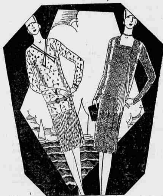
Suits and Ensembles

FASHION COMES THIS SEASON WITH A NEW BRILLIANCE, A NEW RAINBOW OF COLORS, A NEW SILHOUETTE, COMES TO MILLER'S OF COURSE.—AND TONIGHT AN AUTHORITY EVENT WILL BE STAGED IN WAY OF STYLE REVUE. MANNEQUINS WILL DISPLAY SPRING'S LATEST FASHIONS AND BEST OF ALL . . . FASHIONS FROM MILLER'S OWN FASHION SHOPS RATHER THAN IMPORTATIONS JUST FOR SHOW PURPOSES.