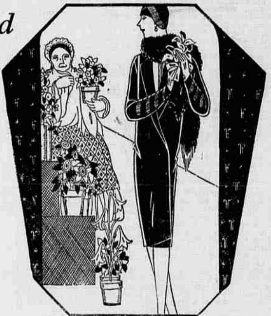
The New Coat

Fashion outdoes herself in these flower tinted frocks for early spring. And in addition to their lovely colors, they are gay with bright flowers to attune them to the season. They ripple and flare in the newest lines; they are bouffant or slim, as their moods dictate, and they are completely modern. Crepe de Chine,orgette and Chiffon, as lovely as a flower garden, and perfect for one's spring wardrobe.