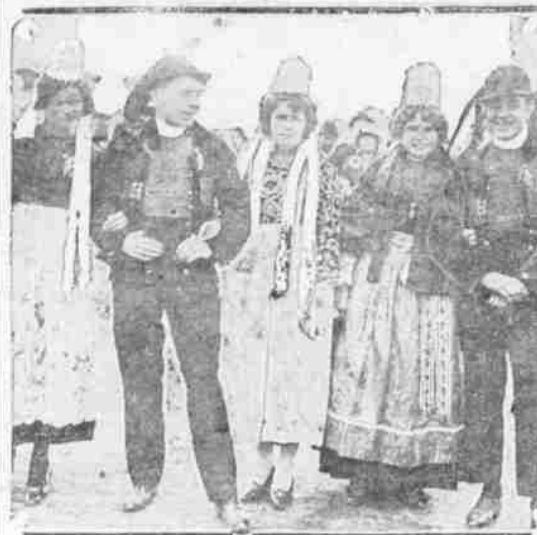
BRIDES DRESSED FOR A MARRIAGE FETE

Quimper, Brittany, Mar. 21.—The first quintuple wedding in a quarter of a century recently brought out all the old Breton customs in the Moelin region.