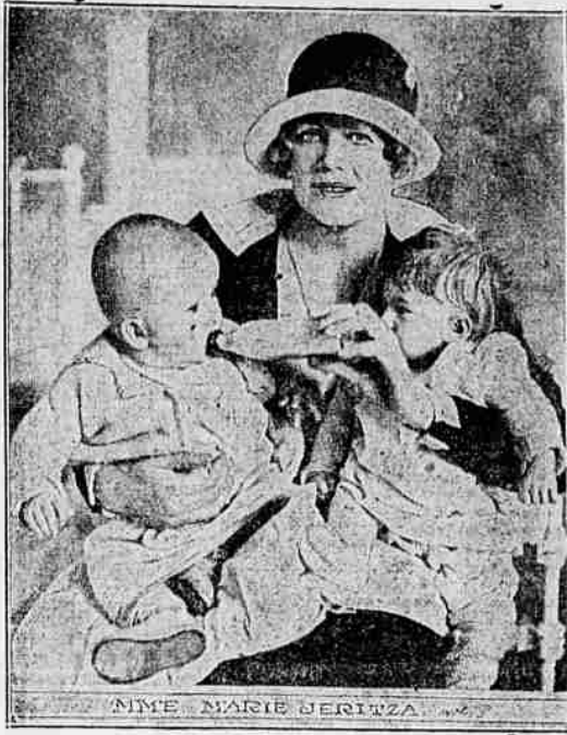
MIME MARIE JERITZA

The famous Metropolitan Opera singer, who gave a benefit for the Loving Arms Day Nursery in New York, where babies are cared for while their mothers work, visited the institution to see the little ones for whom she sang.