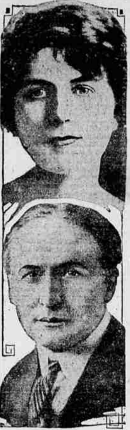
MRS. LE ROY CRANDON & HARRY HOUDINI

Harry Houdini, magician and exposé of fake mediums, was skeptical that the curse of death, called down on his head by Margery (Mrs. Le Roy Crandon) would be effective.