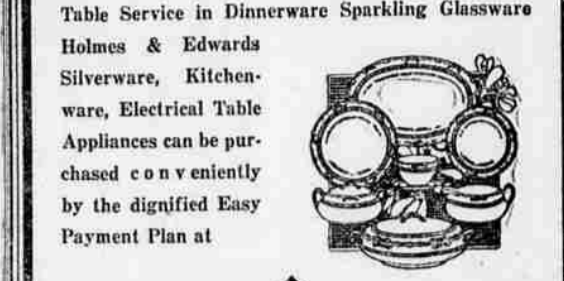
Table Service in Dinnerware Sparkling Glassware Holmes & Edwards Silverware, Kitchenware, Electrical Table Appliances can be purchased conveniently by the dignified Easy Payment Plan at