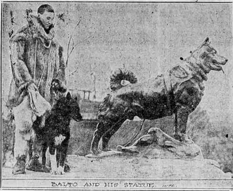
BALTO AND HIS STATUE

barley 1; flour 7; corn 2; oats 4; hay 7.