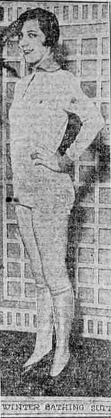
WINTER BATHING SUIT

The woolen suit, with the split turtle neck, is the very latest in winter beach apparel that will be worn by the fashionables in California and Florida.