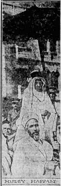
His Imperial Highness, Muley Hassan, on being proclaimed the new ruler of the Spanish Protectorate in Morocco, was borne aloft through the streets on the shoulders of the faithful.